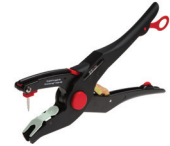
Z2 No-Tear-Tagger ™