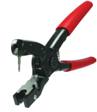
Herdsman ® II Tagger