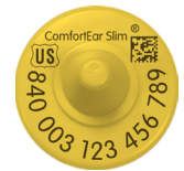
EID 840 USDA Approved